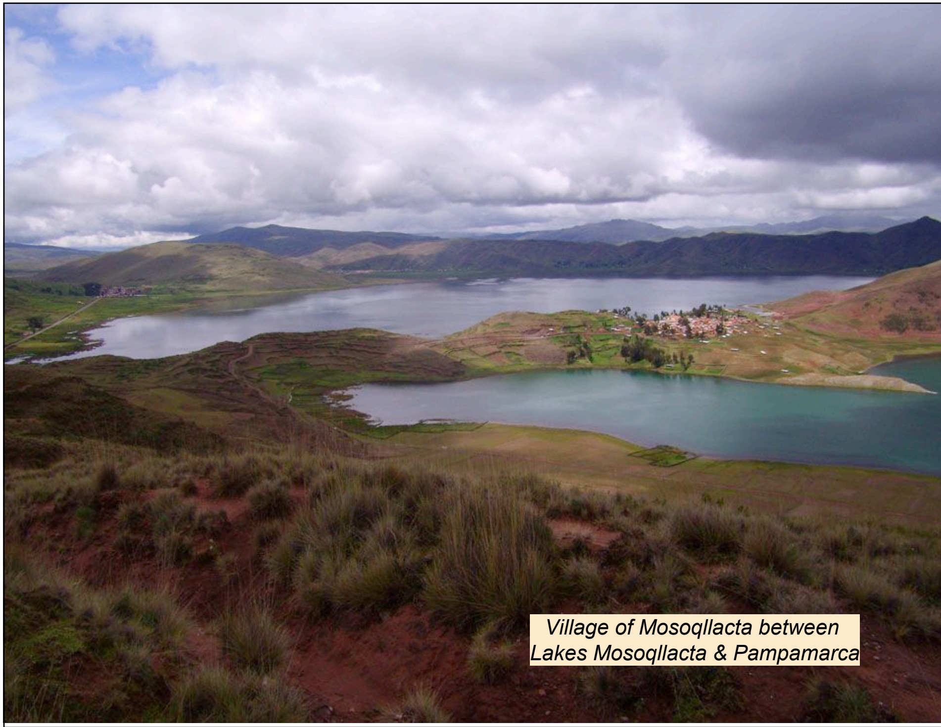
Village of Mosoqllacta between Lakes Mosoqllacta & Pampamarca